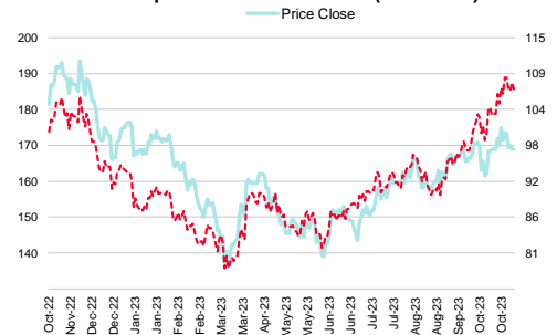
PTT Exploration & Production (PTTEP TB)